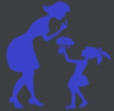
Top 5 States Where Parents Volunteer

Parents volunteer at a higher rate than the general population