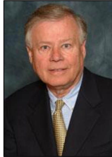
Joseph V. Egan Assemblyman