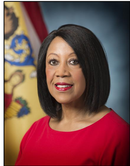
Sheila Oliver Lt. Governor of New Jersey

That does it for state officials, now let's check out who represents New Brunswick at the federal level!