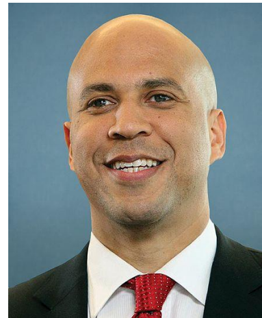
Cory Booker U.S. Senator

These three individuals serve in Congress, which is the Legislative branch of the U.S. government where laws are written and passed. Laws that are passed are sent to another branch of government, the Executive Branch.