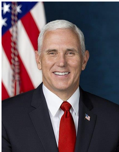
Mike Pence 48th Vice President of the United States