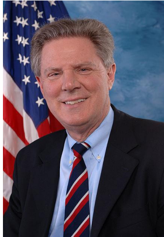
Frank Pallone U.S. Representative

New Brunswick is part of New Jersey's 6th Congressional District (NJ-6), which elects one person to serve in the U.S. House of Representatives out of the 435 total members. The representative from NJ-6 is Frank Pallone, who has served in this roll since 1988.