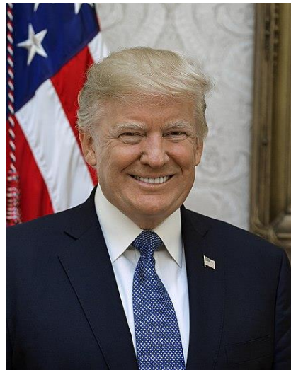
Donald J. Trump 45th President of the United States

The current President of the United States is Donald J. Trump and the current Vice President is Mike Pence.